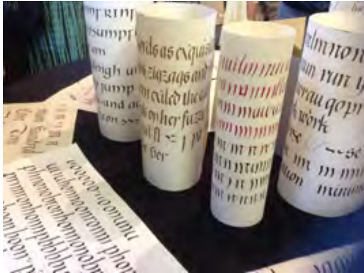
“Show and Share” Italic practice sheets on the last afternoon.

The tools that Denis Brown used at the SUMMIT were not new, but there were some differences in procedure—at least for me. Gouache was loaded on the nib with a brush. He suggested keeping the brush wet, holding it close to the nib, and bringing the nib to the brush when loading the nib. That way it keeps the rhythm going with the least amount of interruption to the flow.