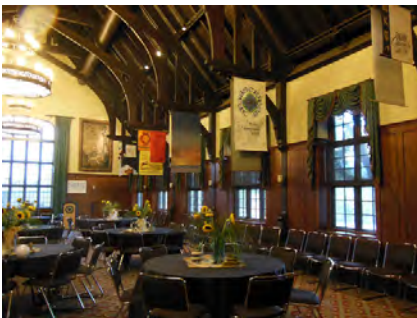
Escribiente's Flag flies!