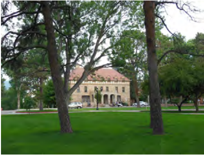
Colorado College Campus

July 21-28, 2013 Colorado College Campus Colorado Springs, CO